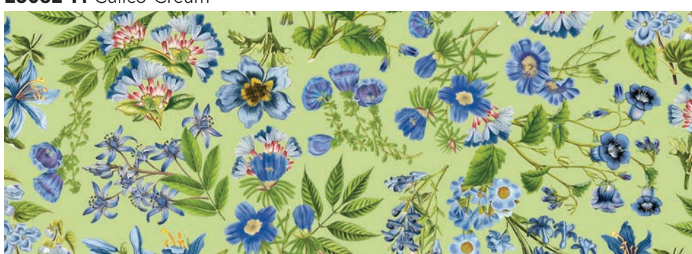
DP25080-72 Small Floral-Green Multi