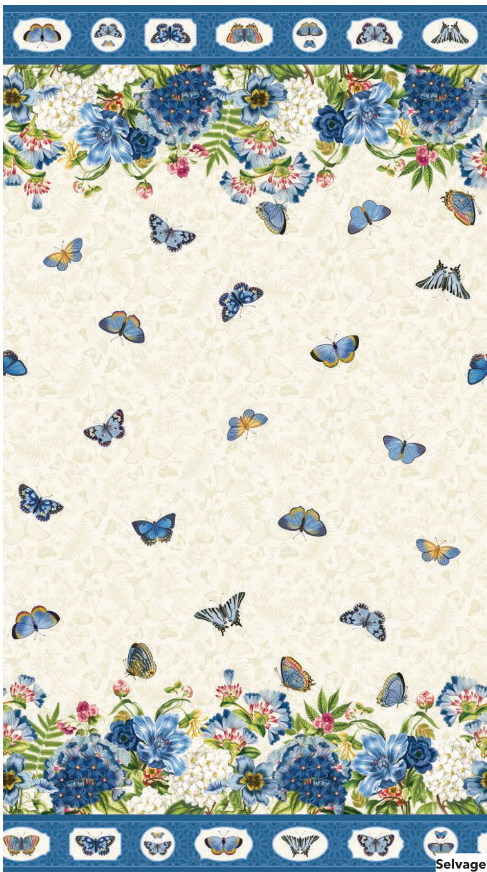
DP25076-11 Full Width Border (Running Yardage)-Cream Multi