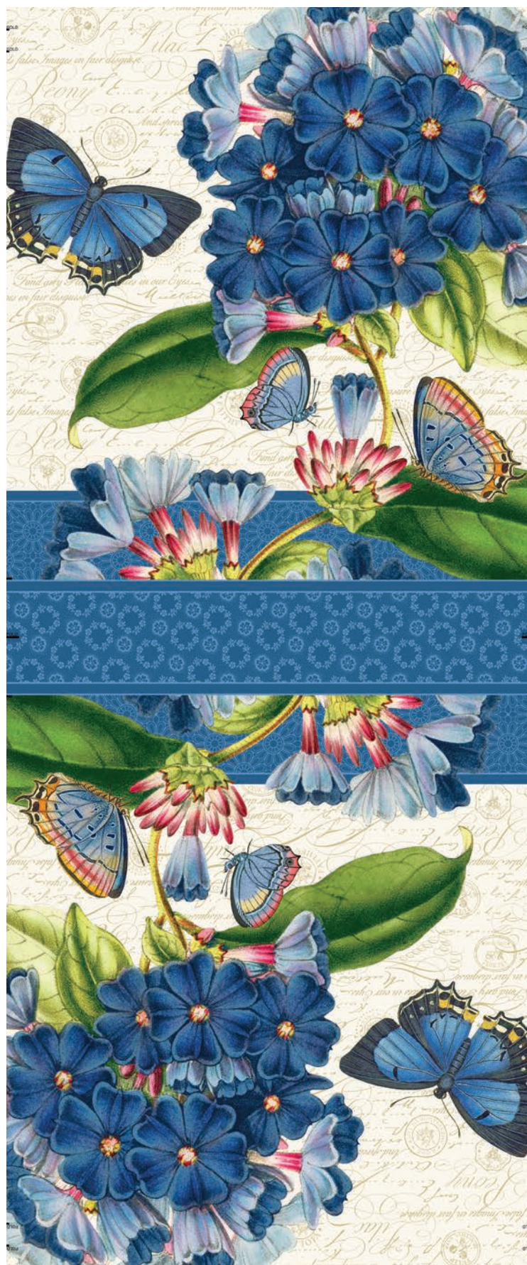
DP25085-11 Bag Panel-Cream Multi 24" x 43"