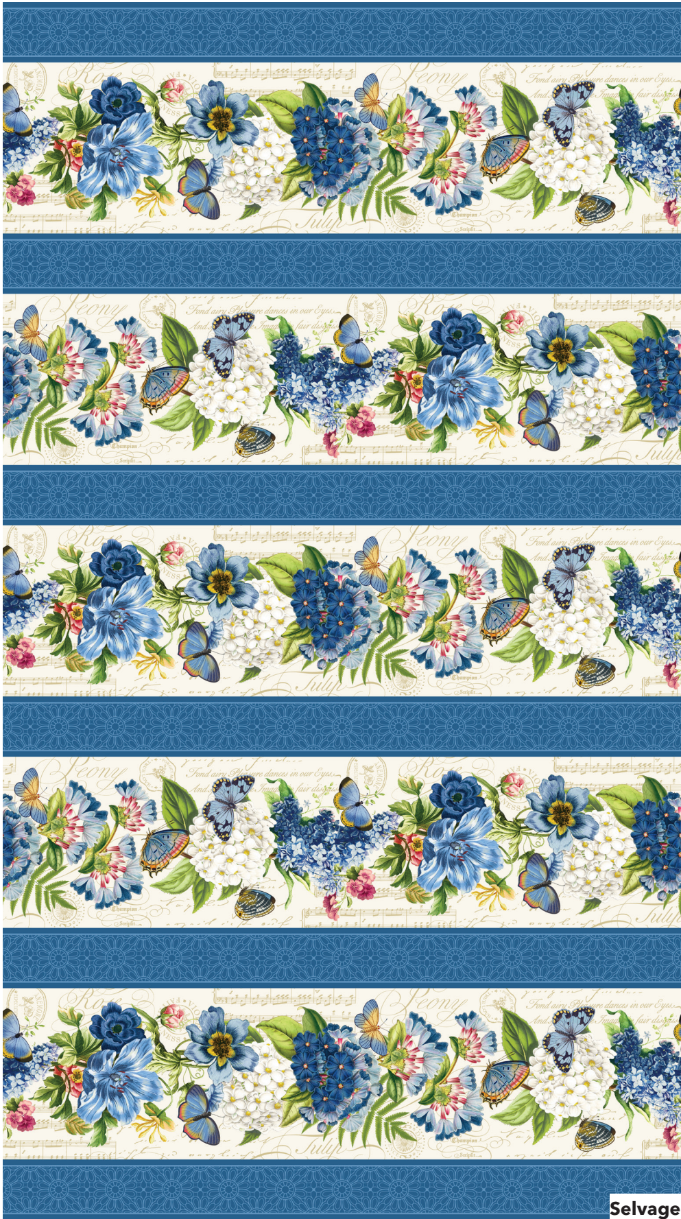
DP25077-11 Border Stripe-Cream Multi