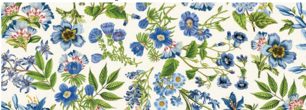
DP25080-11 Small Floral-Cream Multi