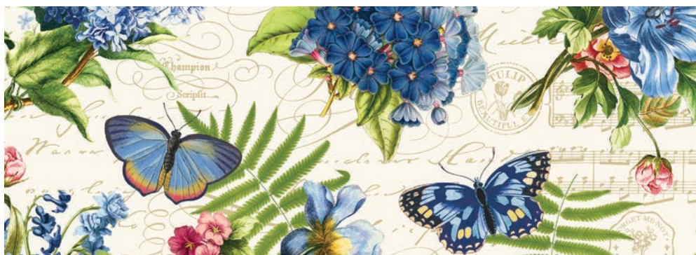
DP25079-11 Feature Floral-Cream Multi 12" Repeat