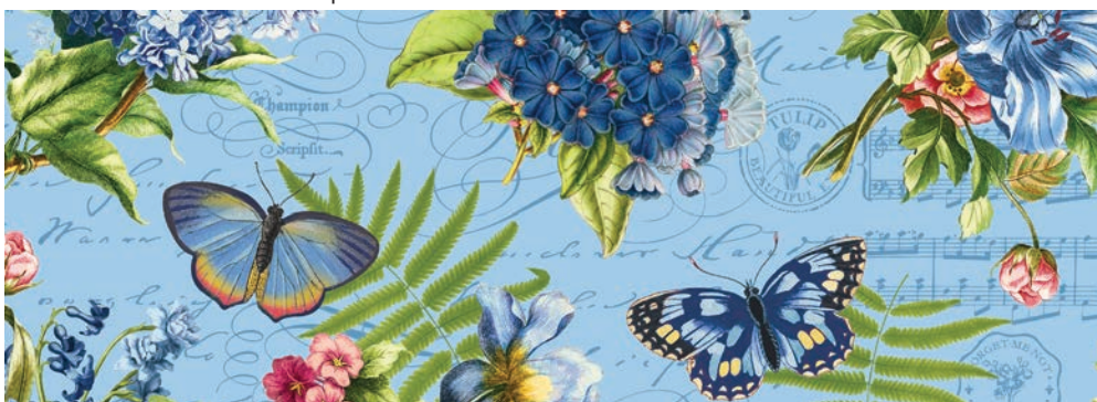
DP25079-42 Feature Floral-Light Blue Multi 12" Repeat