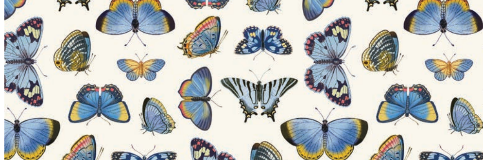
25081-11 Butterflies-Cream Multi 12" Repeat