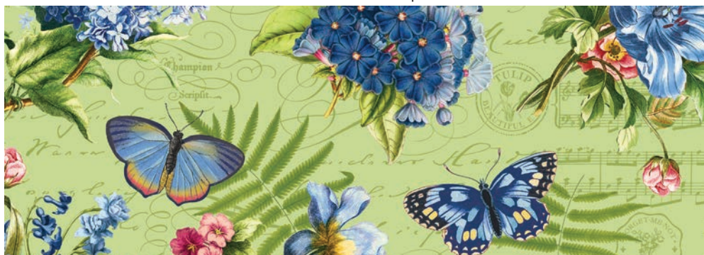
DP25079-72 Feature Floral-Green Multi 12" Repeat

Created by Tina Higgins, Something Blue offers something old, something new, something borrowed and something blue. It is based on tradition that is borrowed from the past yet is updated and new, and certainly offers something blue. Traditional floral prints in small, medium, and large scale in dark, medium, and light values are complemented by a variety of mix and match prints and blenders in blue, green and cream. A lovely full width border, floral stripe and medallion print are featured, while toiles and butterflies as well as a selection of Colorworks premium solids complete the group.