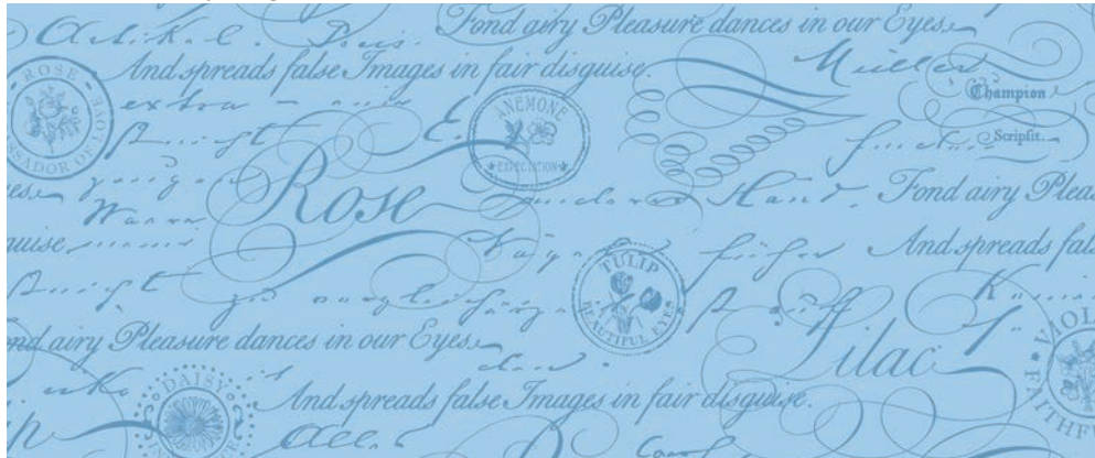
25083-42 Script-Light Blue