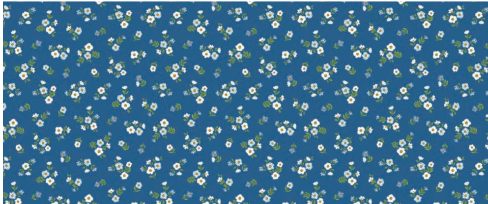
25082-44 Calico-Dark Blue