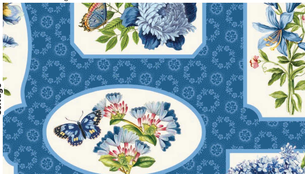
DP25078-44 Floral Medallions-Dark Blue Multi 24" Repeat