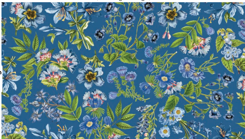
DP25080-44 Small Floral-Dark Blue Multi